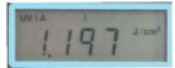
The "SELECT" button allows you to toggle between Watts and Joules.